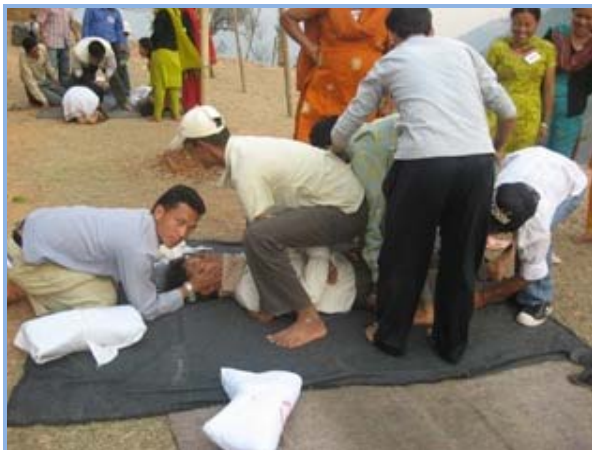
Demonstration tackling emergency

The Government of Nepal endorsed in 2006 the National School Health Nutrition Strategy that aims at improving health and nutritional status of the school children. Since 2007, CCS Italy NCO has adopted its working modality to the new SHN strategy of Nepal that is supporting with the partners organizations in working area of Kavre and Kathmandu districts.