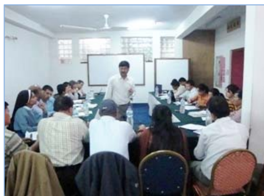
Delivering technique of social audit

Being one of the executive member of NCEN and general member of AIN Education Working Group, CCS Italy NCO is actively participating in all events organized by NCEN and AIN/education working group. CCS Italy NCO hopes the campaign on 1Goal: Education for All will be continued and no child will be out of school in Nepal by the end of 2015. Through this e-newsletter, CCS Italy NCO would like to request all readers to join hands to achieve '1Goal: Education for All'.