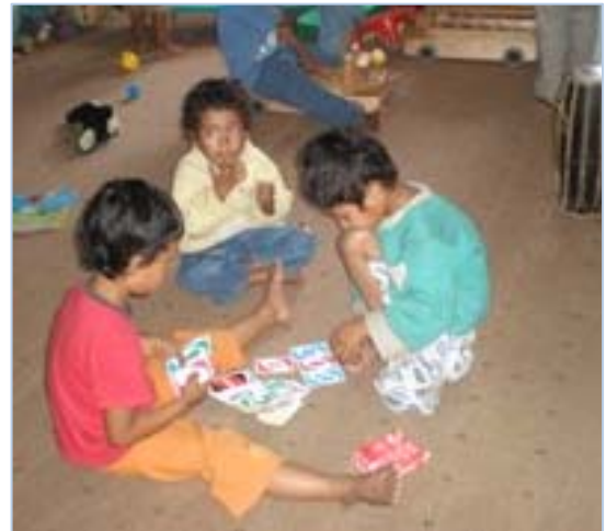
Informal learning is the best

CCS Italy NCO also focused to develop partner organization's overall Institutional Development through different level of training/workshop, setting milestones and assigning tutors for regular tutoring/coaching. We have been partnering with Nepal Little Flower Society in Chitwan and Makwanpur, Prisoners Assistance, Karuna Bhawan, Education Resource Development Centre Nepal, People Dental College and Hospital in Kathmandu & Lalitpur districts, Centre for Cooperation and Development Nepal and Timal Community Rural Electrification Cooperative Association in Kavre district.