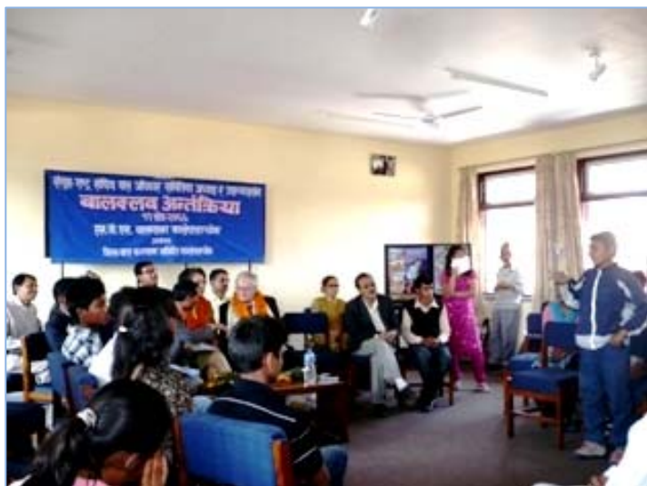
Advocacy for child rights

Three days training on child rights, child club management, health, sanitation and hygiene is provided to them each year. Two child club member and one focal teacher from each school participate in the training. Material is also supported to them to manage and regulate the club.