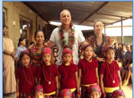
Program observation by HQ and URS members

This has been a very important undertaking that required considerable and substantial work at all levels of the organization in order to create a quality management framework in its entire operations was started. CCS Italy NCO officially received the UNI EN ISO 9001:2008 quality management standards certification on April 2009. It was issued by the British auditing firm URS.