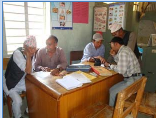
SMC members responding client satisfaction questions

Client satisfaction is one of the components of final year evaluation. It is the key element to measure development changes at local level and is a continuous process to improve the program. Different questionnaire were used to collect information from direct beneficiaries i.e. from Children, School Management Committee and POs to understand their level of satisfaction of the programs implemented in 2009.